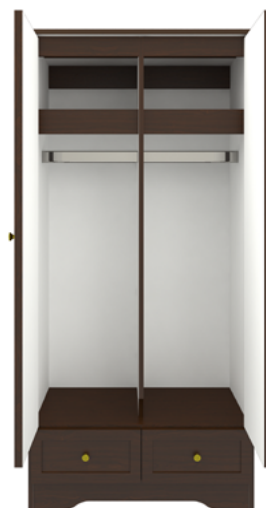
Model: MIALZ 34.5W 23.75D 71H

Kwalu's Mission Dementia/Alzheimers Wardrobes are thoughtfully designed to support resident independence and safety. Light colored interiors help with spatial orientation. Features include softly rounded edges and waterfall detailing. Hidden door latches and passive locks allow caregivers exclusive access. Choose from dozens of hardware styles, including ADA compliant. The product is required to be wall mounted for safety. Using the kit provided, please follow provided instructions exactly.